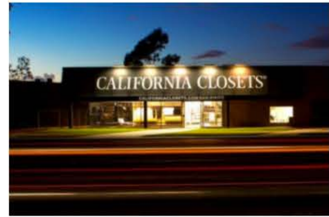
California Closets, San Diego & Inland Empire HOME ORGANIZATION