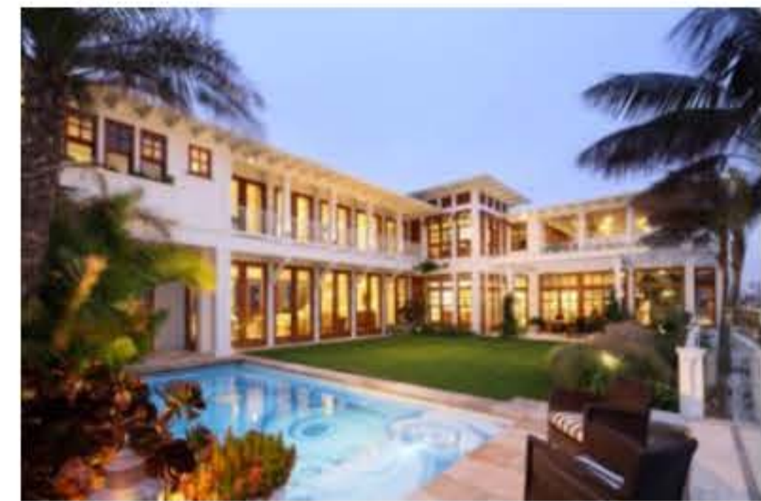
JD Group Inc. HOME BUILDERS