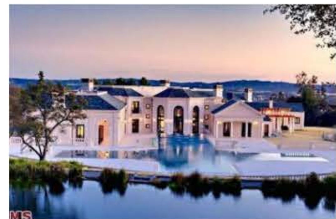
Engel & Volkers REAL ESTATE